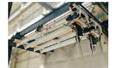
Electric E/R Crane