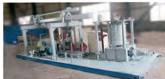
Deep-sea Detector Delivery Device