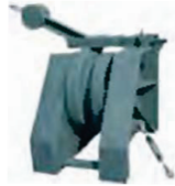
掣链器 Chain Cable Stopper