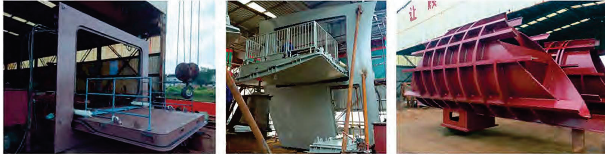
Stern Doors for Luxury Cruise