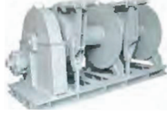
液压系泊绞车 Hydraulic Mooring Winch