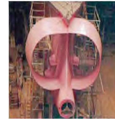
Wake Improving Duct