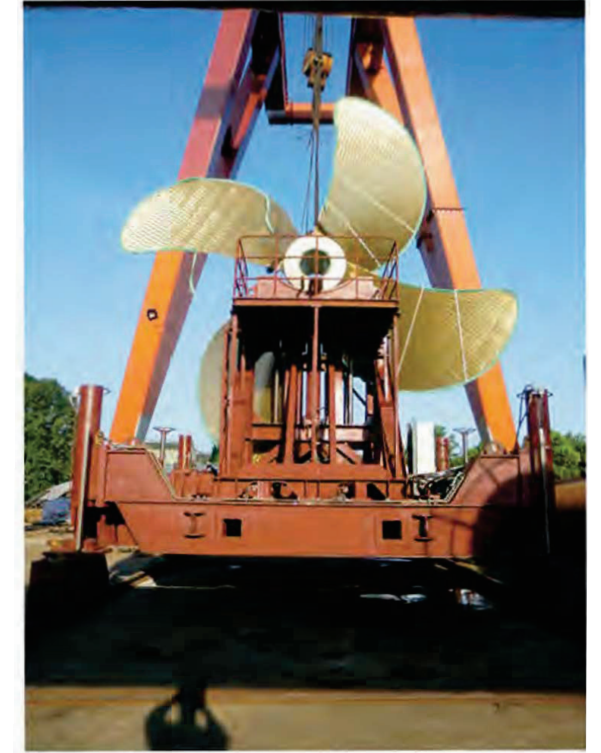
螺旋桨安装车 Propeller Installation Trolley