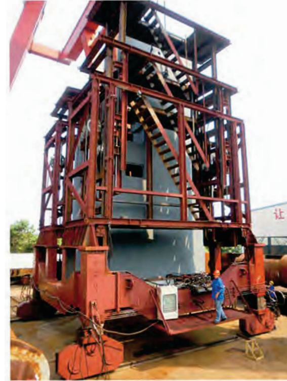
舵叶安装车 Rudder Blade Installation Trolley