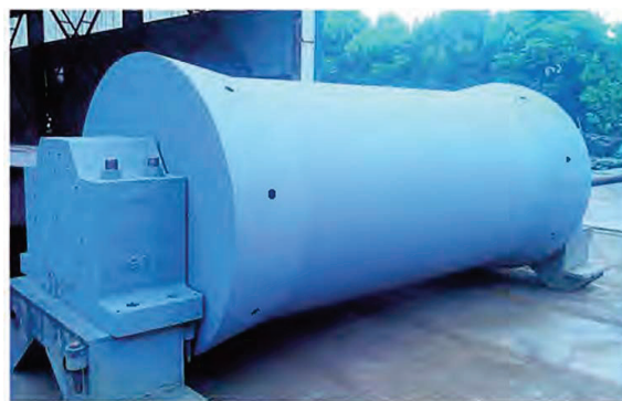
Single Stern Roller(water / oil lubricate)