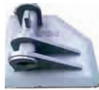
拖航眼板 Smit Bracket