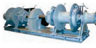
液压起锚系泊组合机 Hydraulic Combined Windlass Mooring Winch