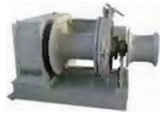
Electric Mooring Winch