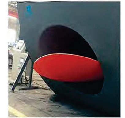
Cover Device for Bow Thruster