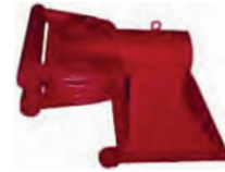
万向(旋转)导缆器 Anchor Fairleader