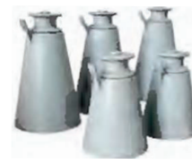
羊角滚轮导缆器 Roller Fairlead with Guard