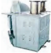
鲨鱼钳 Shark Jaw