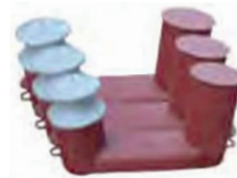
单滚轮带缆桩 Bollard with Single Roller