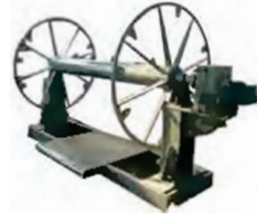
舷梯收放绞车 Gangway Winch