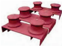
二滚滚轮组 Double Wheel Group