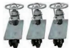
螺旋弃锚器 Releasing Anchor