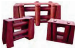
导缆器 Fairlead with Horizontal Rolles