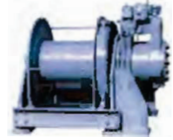
液压起货机 Hydraulic Cargo Winch