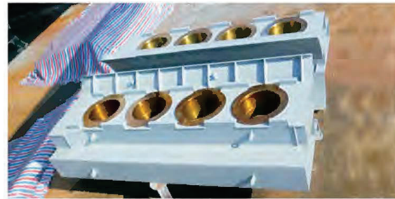
Oil Platform Lift Gear Box