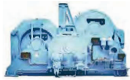
拖缆机 Towing Equipment