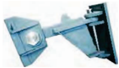
系泊夹具 Mooring Fixture