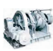
电动起锚系泊组合机 Electric Combined Windlass Mooring Winch