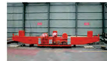
Electric Provision Crane